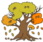
leaves and fruit falling